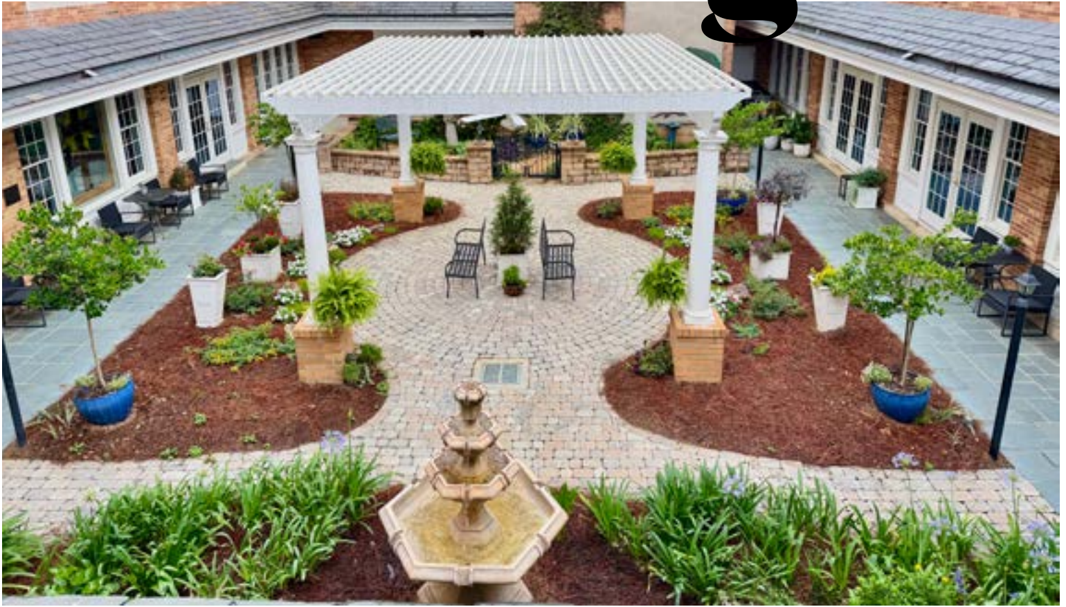
A Monthly Publication from Trinity United Methodist Church, Tallahassee, FL