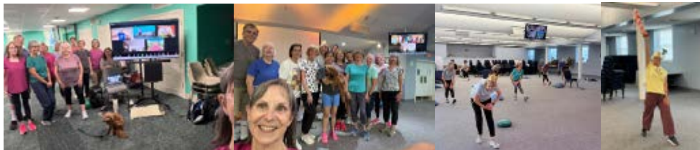
Stay strong all summer long and enjoy the fellowship and encouragement of your BFC exercise classmates.

Stay active, have fun, and be part of something special this summer with BFC Ministry!