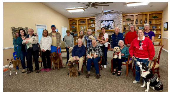
Trinity Ministry Dogs picture: Elena, Ziggy, Stevie Nix, Elliott, Chewy, Derby, Maggie, Sushi, Abbey, Belle, and Sophie

We look forward to hearing from you and hope that the Trinity Ministry Dogs can bring a smile to your face and comfort to your heart. Thank you for being a valued member of our church community.