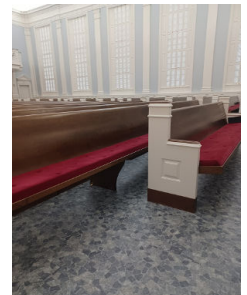
Shortened pews in the sanctuary provide spaces for those who need special accommodation for wheelchair access.

First, the DEI working group has proposed policies and programs that would help to make all people feel welcome in our church building, on our campus, and throughout our areas of outreach. If God's love is present in every corner and crevice, then our hospitality should be also. In light of this holy presence, we have advocated for full accommodation for the physically challenged in regard to parking spaces, entrances, sanctuary seating, and other places relating to church life. In turn, we support ways that Trinity can provide warm and friendly spaces for the unhoused, where they can take refuge from the often harsh reality they encounter in outside urban life.