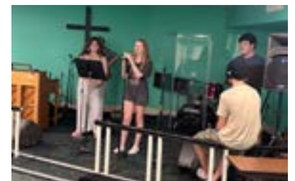
Youth Praise Band