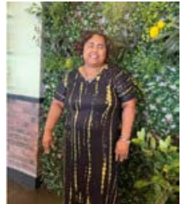
Ivy visiting Dayton, Ohio

Right now, I’m enjoying the view of white dogwood trees, tulips and blue phloxes in Ohio. And I look forward to the differences that are the Florida varieties of plants.