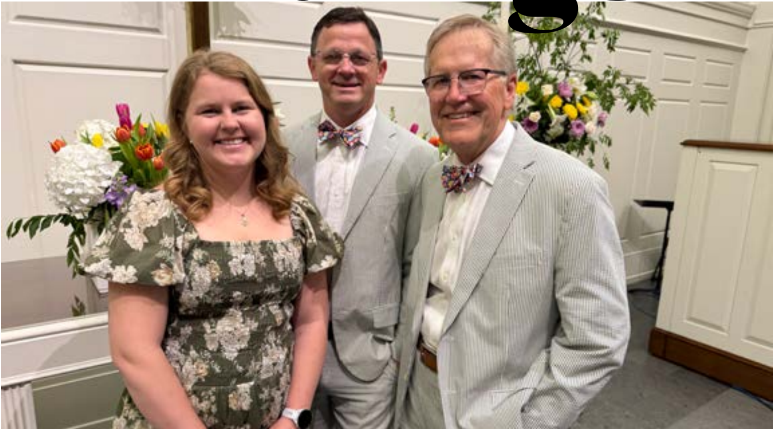
A Monthly Publication from Trinity United Methodist Church, Tallahassee, FL