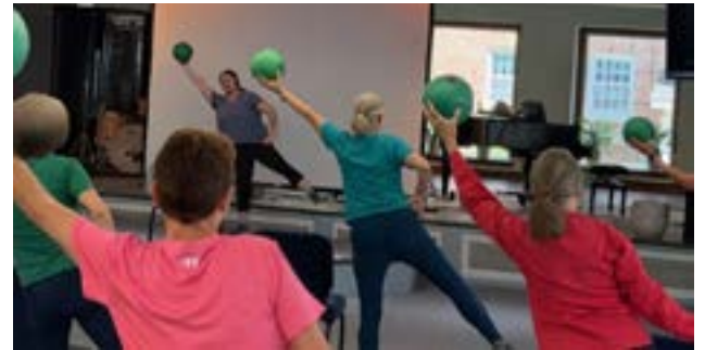
BFC classes meet at Trinity on Tuesdays and Thursdays

Questions? Please call the church office, and our Finance Department will be happy to assist you.