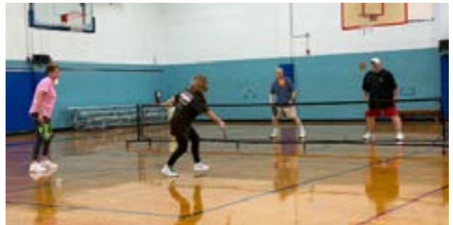
Trinity Pickleball players at First Baptist Church